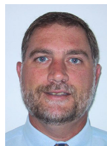
Computing, and Journal of Accounting Education.

and Information Systems at Virginia Polytechnic and State University and has published articles in Journal of Computer Information System, Journal of End User